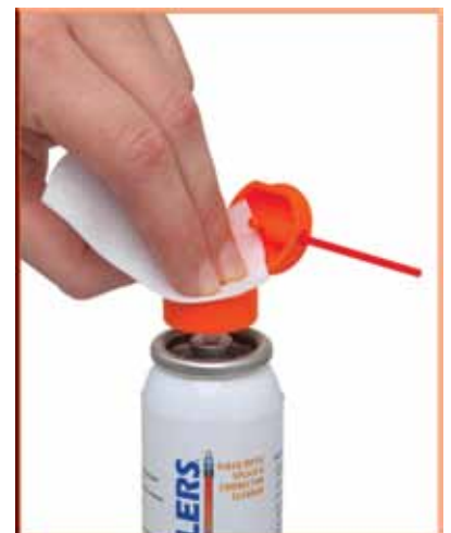
Or to dampen the CleanWipes™ for splicing