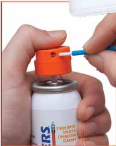
Use the Cleaning Fluid to dampen the CleanStixx™