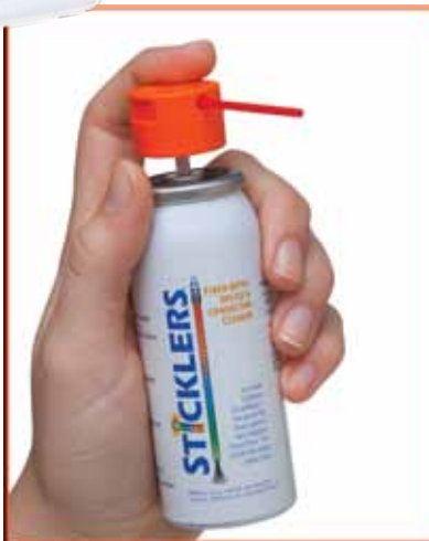
Or to flush out ports and connectors